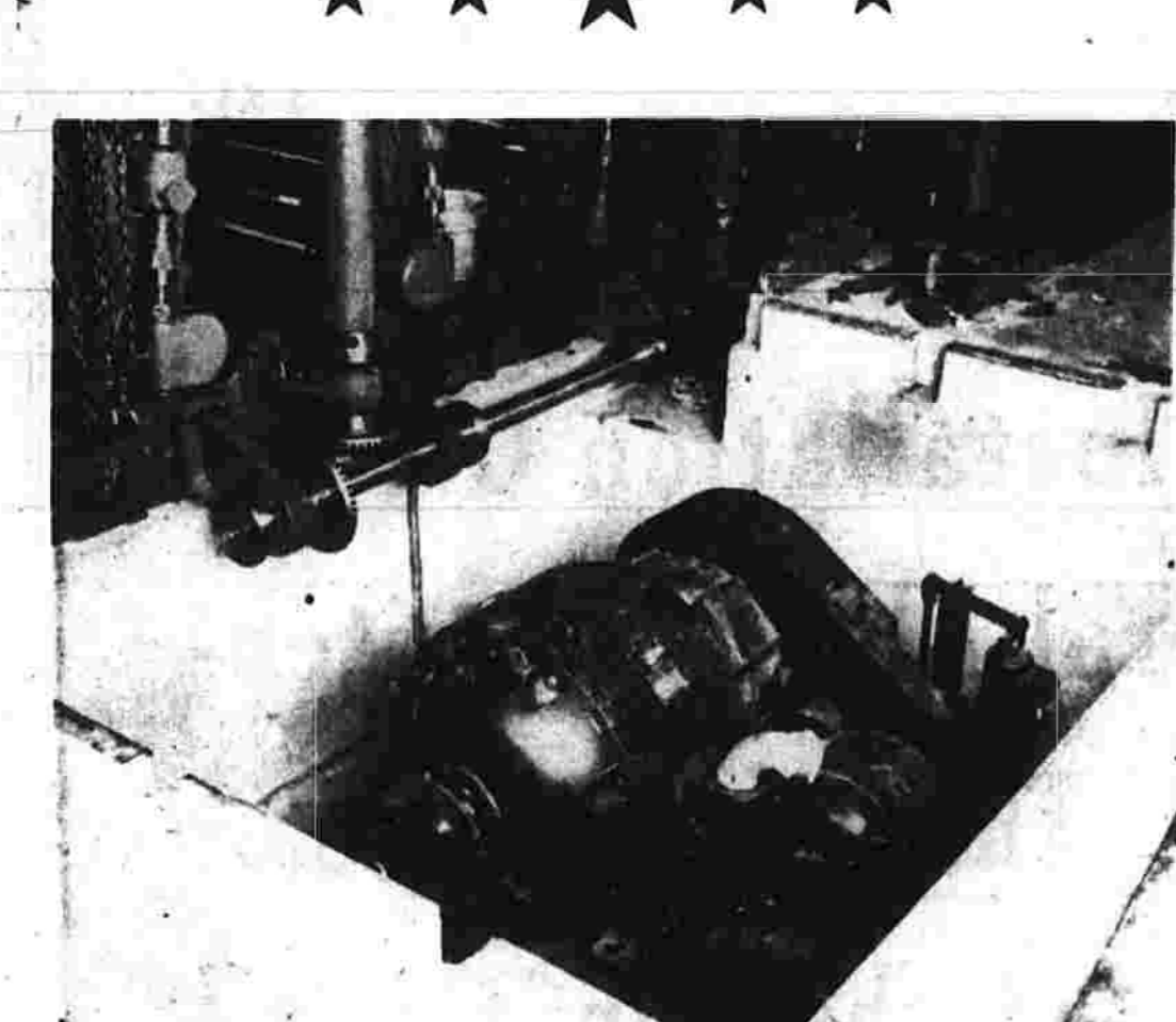
This is the heart of the new press. A three-ton heart of metal and wiring, it furnishes the driving power to turn those gears and metal-rod rollers. It's a General Electric 75-horsepower motor, the power plant. Set in a pit alongside the press, the power plant is completely hidden from view normally by wide strips of corrugated iron that fit flush into the concrete floor. The "baby" motor nestled at the right of the pit is a jog motor and provides sufficient power for the press men to "jockey" the plate cylinders into position each day prior to throwing the press into full operation. Big "paw" automatics take over when the press men push the button marked "Fast." The pump-like mechanism at the right is a hydraulic brake that brings the power plant to a halt at the end of each day's run.

Two Herald pressmen and a paper was printed on a sheet-fed cylinder press when he first began here. Each four page sheet had to be fed into the press individually. The paper then contained eight pages. Two years later, in 1914, the organization graduated to a roll-fed, flat-bed press, and in 1923 the press which has just been sold was acquired. That one, a Duplex tubular, was in The Herald's possession only nine days when fire struck and damaged it slightly. It had to be dismantled, McGonigal recalls, and reassembled. Meanwhile The Herald was printed at the Hartford Courant and the now defunct Manchester News. McGonigal maintains that the first big news break in the country occurred about two weeks after he first took over his job at 14. That was when the Titanic on her maiden voyage, hit an iceberg off Cape Race in 1912. Although Joseph LaForge is the youngest member of the trio, he has his share of memories of past events. He started in 1925 as a printer's devil and two years later McGonigal "took me under his wing" at the press. LaForge impressed with the fact that on the day after the big hurricane in September, 1938, The Herald's press printed over 30,000 copies of the Catholic Transcript besides the regular edition of the Herald.