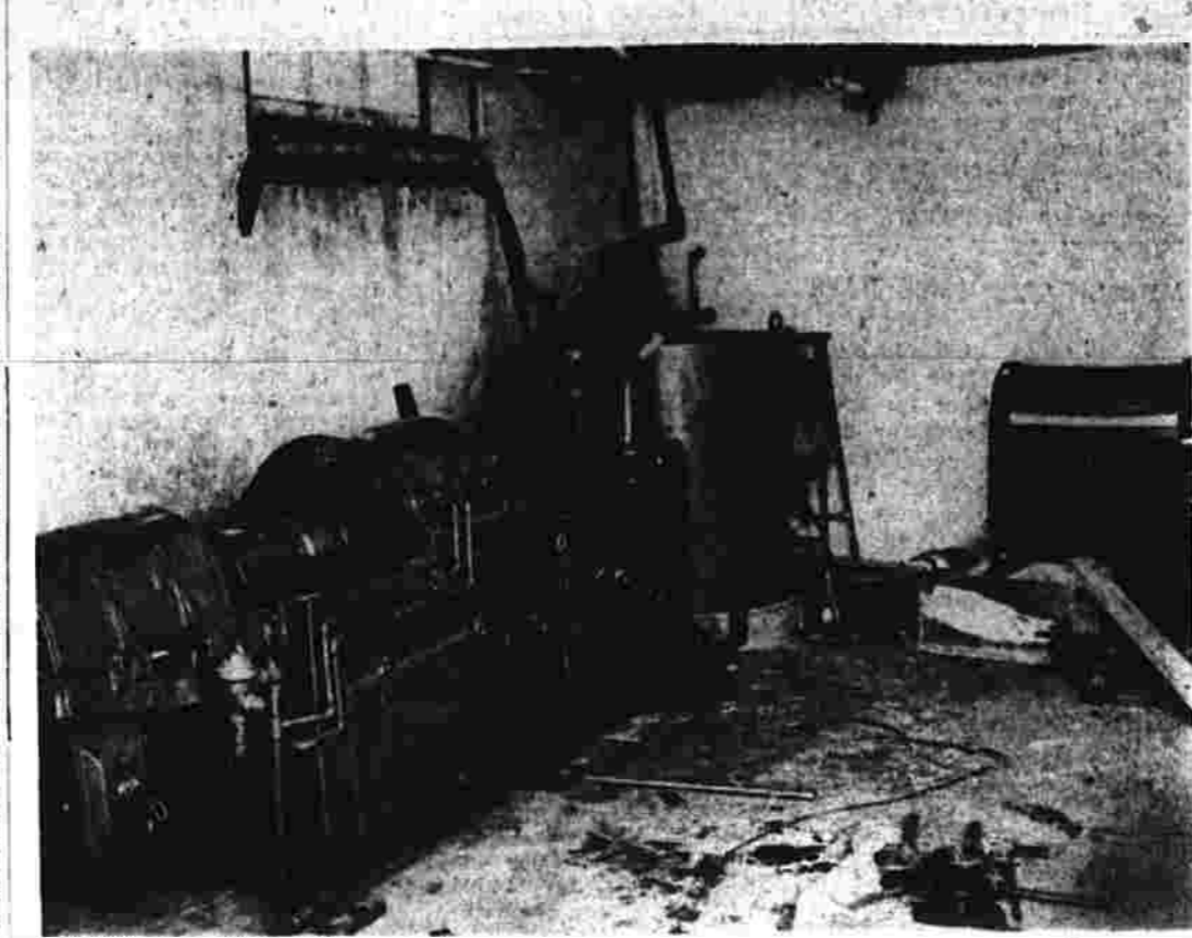
The new press stereotyping equipment is located in the southeast corner of the press room. The long conjoined apparatus at the left is a Pony Auto Plate manufactured by the Wood Newspaper Machinery Co. of Plainfield, N. J. Here the metal plates from which each page of this newspaper is printed are automatically bored, trimmed and cooled, operations previously done at the Herald by separate machines and by hand. The large round vat in the center is called a lead pot and holds about 6,000 pounds of stereotype metal. The pot is heated by thermostatically controlled electric units. The box-like apparatus at the right is a Sta-Hi Scooper which, by controlled heat timing, processes and prepares the matrix for casting in the Pony Auto Plate.

In a former store room in the basement of the Herald plant on Biswell street, a new Goss Universal press—40 tons of blue-grey machinery—stands as a symbol of this newspaper's growth and as a fitting monument to the memory of the man who directed its purchase, the late Thomas Ferguson, publisher of The Herald for 27 years until his death three months ago. The decision to obtain the new press, the first of its kind now in New England, was taken by Mr. Ferguson after it was realized that the old Duplex tubular press, which had been printing the Herald since 1921 and it was 10 years old then could no longer meet the demands of the constantly growing newspaper. The capacity of the old press was only 20 pages and there were many times that even a minimum of the advertising and news coverage demands of the growing newspaper would burst these confines and require 24 and even 28 pages. As a result, on those occasions the paper had to go beyond capacity. It had to be run through the press in two sections and every one in the plant was called down to the pressroom to help "stuff" which means just that—stuff one section into the other. Delaying production and adding to the labor cost, as it did, stuffing was a constant source of irritation. Considered Addition Three years ago, however, when