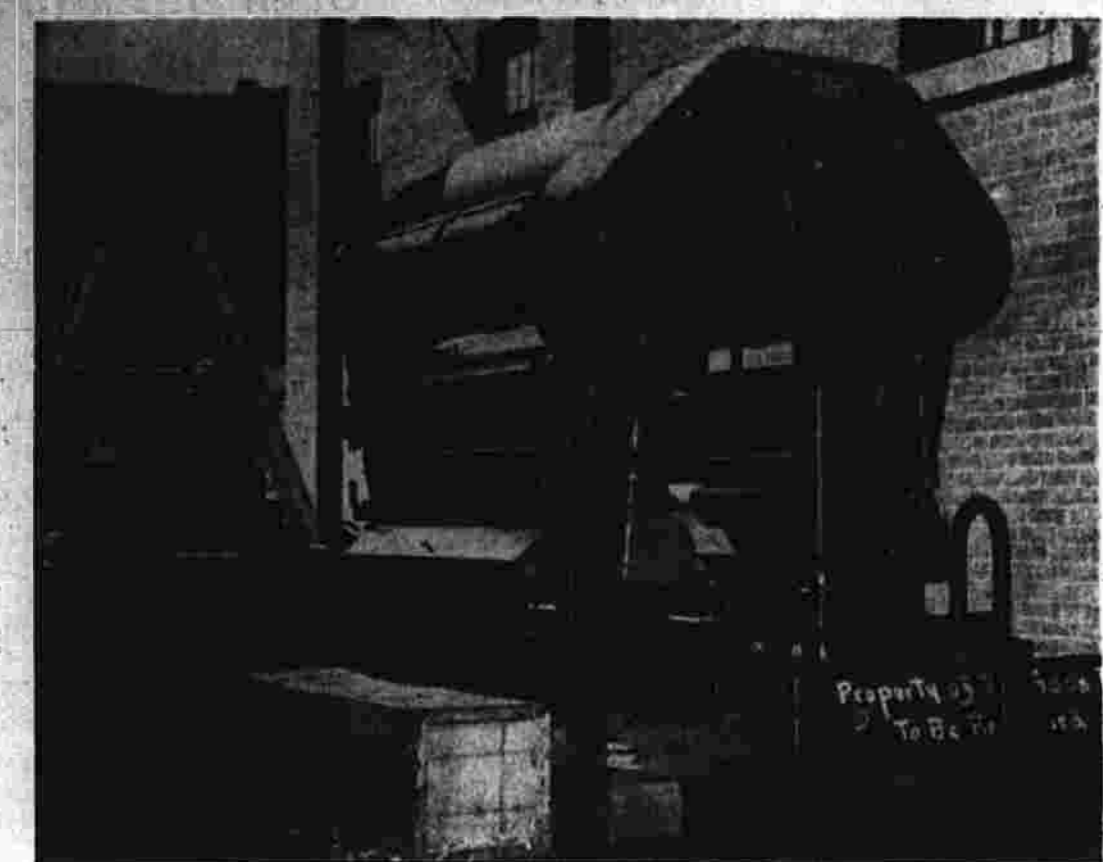
On Tuesday, Sept. 25, the first of the five massive units that comprise the Herald's new Goss press arrived from Chicago, Ill. The long, slow journey was made via tandem trailer trucks. The unit, each of which weighs six tons, were unloaded at the Downing & Perkins company at Hartford. The first to arrive is shown here mounted on a rigger's truck parked in a driveway at the Herald plant. Shortly after this photograph was taken, the 12,000 pounds of finely machined steel and precision ground, green-protected gears started the laborious and painstakingly deliberate trip into the basement of the building. There was placed in a room which, only a few months ago, was a rather crowded cellar and has since been converted into a steaming, completely modern press room.